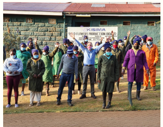
Celebrating Gold accreditation

Kisima Floriculture has been certified to the Gold accreditation standard, the highest possible standard in Kenya by the Kenya Flower Council. This is a real achievement and sets us on the path to social and environmental sustainability excellence.