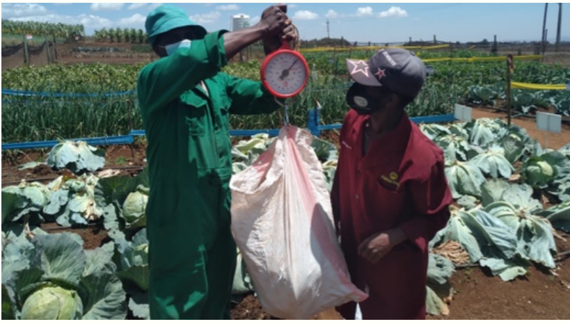
an 11kg cabbage grown on the demo site