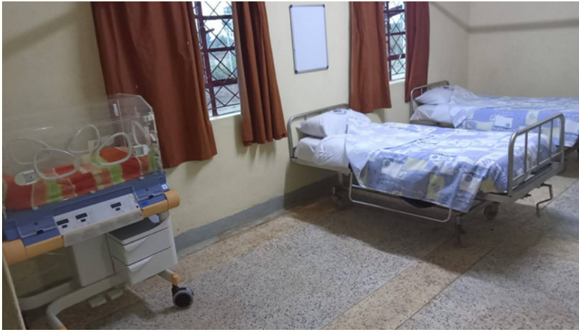
The new in-patient unit at GHC

The health services provided during that period included curative services, maternal health care and delivery, child health, family planning, HIV counseling and testing, immunization, dental care, laboratory, and mobile outreach services. Health education was provided to patients visiting the health facility as well as through mobile outreach clinics at schools, farms, and community welfare groups.