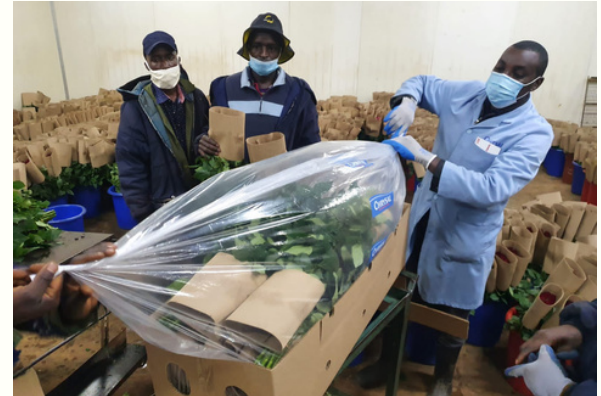
Packing the roses for sea freight

In early December our first sea freight container left for Europe packed with flowers. The container will arrive in the first week of January and it will be very interesting to see how this trial goes with regards to reducing our air freight carbon emissions for floriculture.