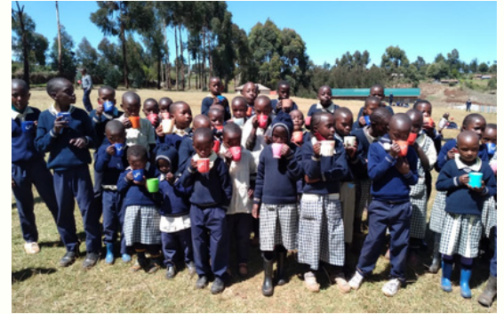
Porridge at Gundua Primary School

The feeding program started up again once schools opened and around 2,400 children from 6 schools benefitted from the program.