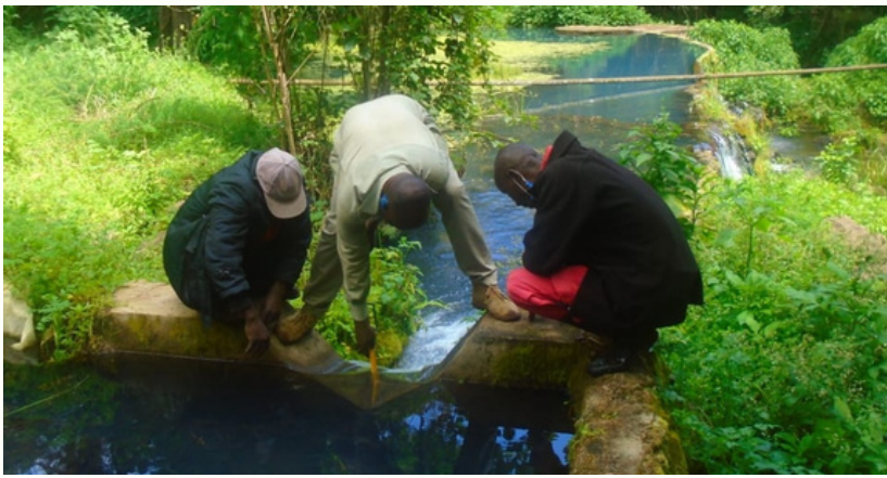
Checking the WRUA reading