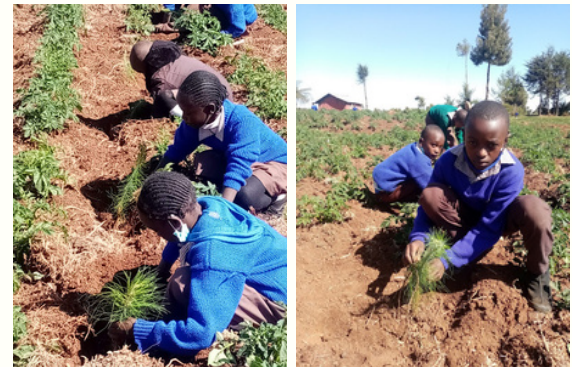
Planting trees at Gundua Primary School

At Mugumone School over 100 avocado trees were planted by the students in November and December and the children in grades 5,6 & 7 adopted trees to take home and plant.