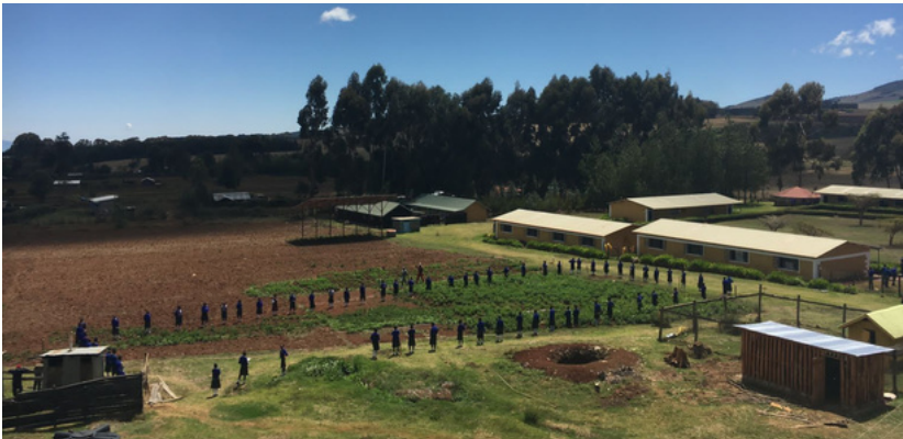
Students showing where the dormitory will be built

The building of a girls dormitory has started at Gundua Secondary School. It will allow girls to board at school rather than have to travel to school each day.