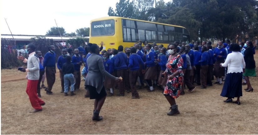
Teachers and pupils welcome to new bus with singing and dancing

The Gundua Primary and Secondary Schools continue to provide a high level of education to many children in Buuri Sub-County. The Gundua Foundation has procured a new 32-seater bus which will be shared by schools in the area. Schools can request to use the bus for educational and extracurricular activities. The bus was received with huge excitement from the students!